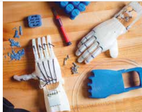
Students downloaded the plans for Raptor Hand, an open-source design online, and adapted it specifically for Emmy.

Now Emmy will be able to reach the childhood milestones of riding a bike, thanks to Messiah's